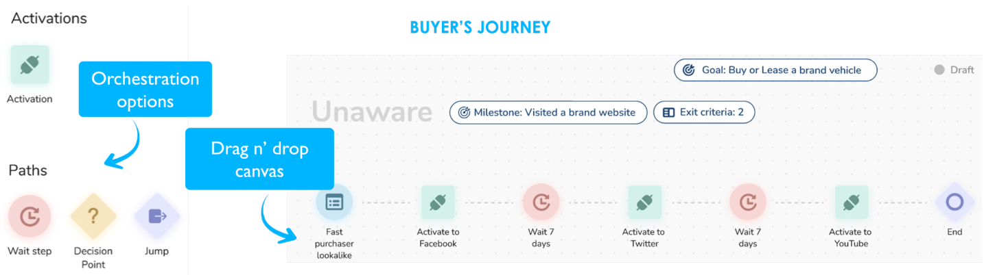
Figure 1: Treasure Data Journey Orchestration canvas

Building on intelligence from the Treasure Data customer data platform (CDP), you can identify audiences along the buying cycle and link relevant campaigns and channels to user behavior, making best-of-breed channel and campaign tools smarter. With a visual, no-code canvas, marketers can plan journeys that are personalized for each customer, based on data-driven insight, as they progress from awareness to purchase to brand loyalty and engage with marketing, service and sales for a frictionless customer-centric experience across the entire business.