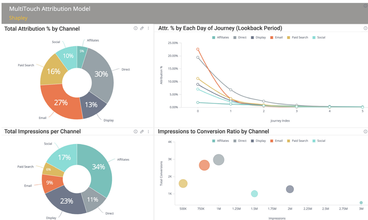
Figure 3: Analyzing impact for each channel

This channel feedback and holistic data also enables marketers to get the most from their budgets. If you know an email is driving the most conversions, or a Facebook post is driving the most engagement, you know how to achieve more with the same budget.